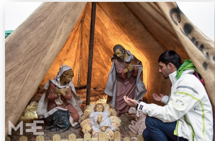
An Iraqi Christian refugee prays in front of the tent

On Christmas night the figures will all be together inside the tent. You could also find pictures of today's marginalised people and place them within the tent. You can take away the lantern, as Jesus himself is the light of the world.